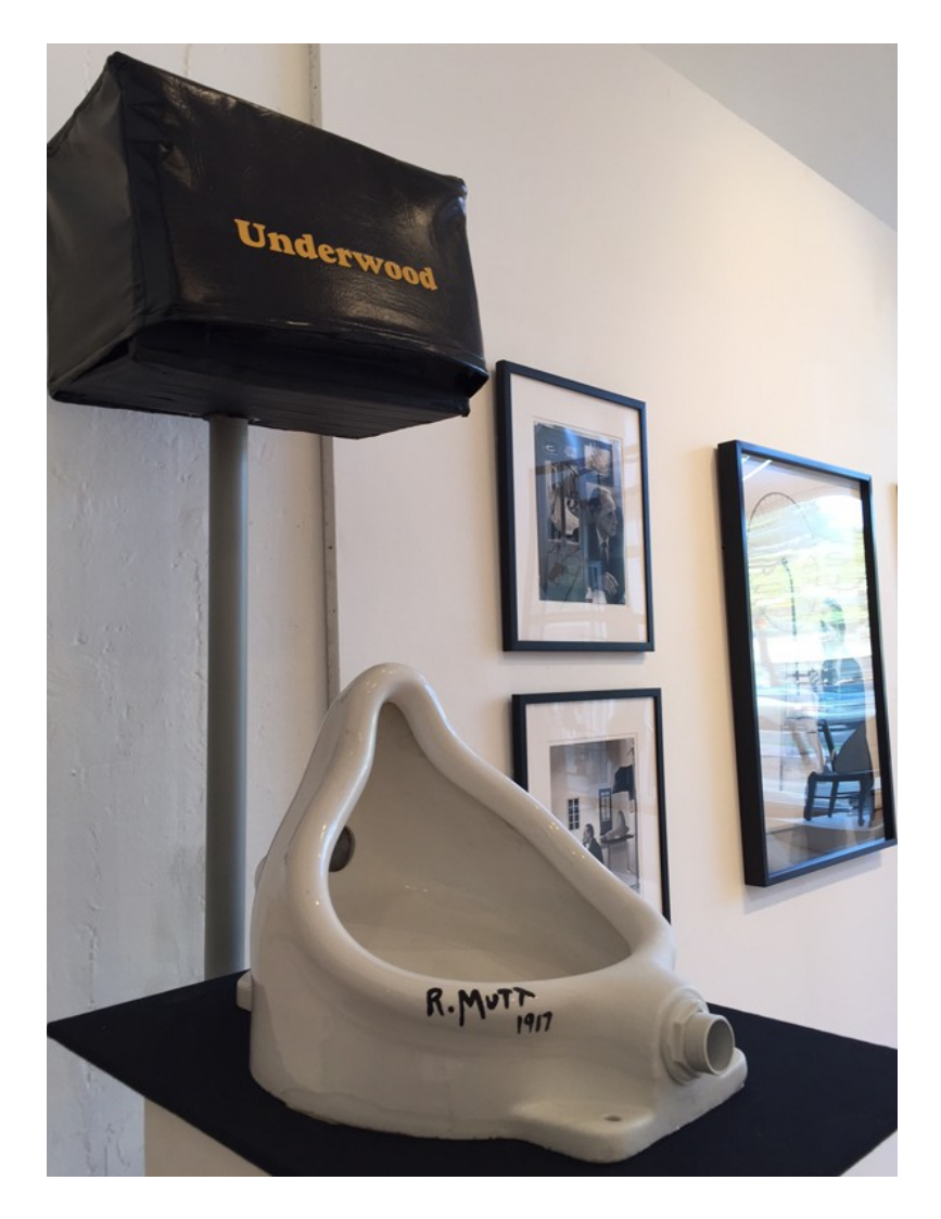
Installation view of JULIAN WASSER: DUCHAMP IN PASADENA REVISITED... (Summer 2015).

Some exhibitions are notable for their broad strokes, exposing emerging trends or highlighting past movements, while other exhibitions expound upon a sliver of experience, expanding our understanding of the moment under detailed study. By selecting an iconic image and fleshing it out, Wasser's notorious photograph is stripped bare and revealed anew—no longer a mysterious whodunit, but a well documented moment in time presaging West Coast conceptual ascendency.