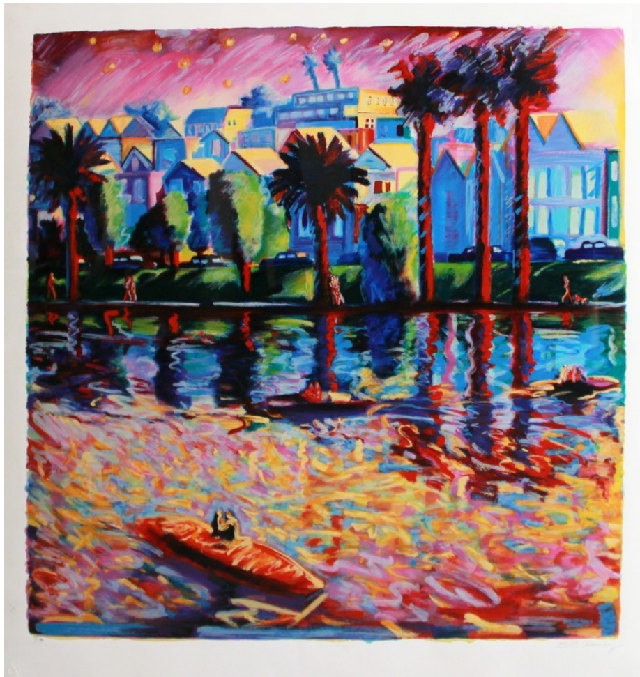
Carlos Almaraz. Echo Park Three, 1990