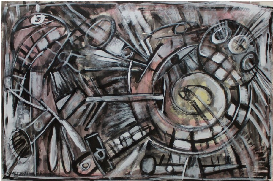
Carlos Alfonzo. Untitled, 1988