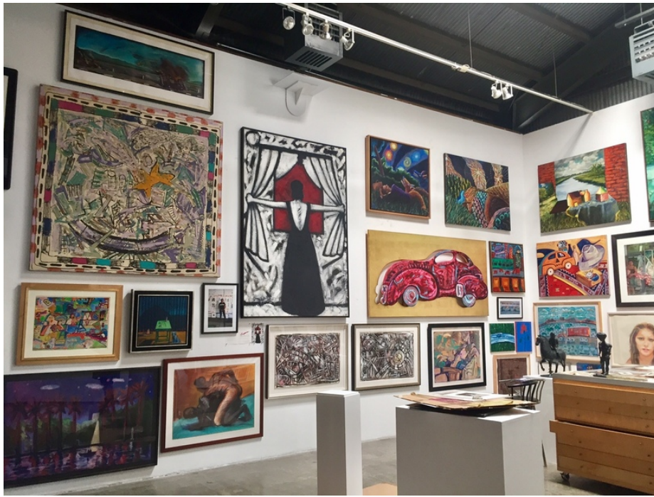
PST LA/LA/LA at Robert Berman Gallery. Installation view.