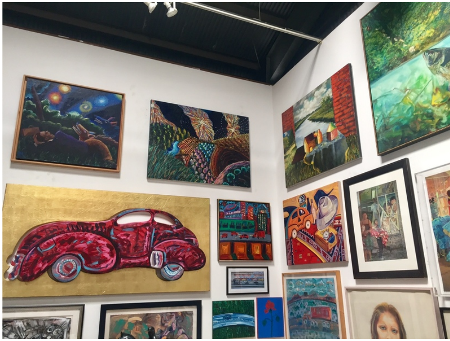
PST LA/LA/LA at Robert Berman Gallery. Installation view.