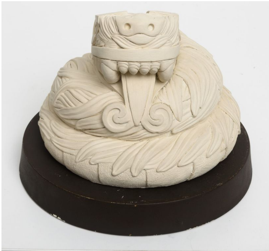
Robert Graham. Study for Plumed Serpent (Quetzalcóatl), 1994