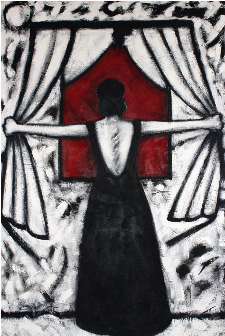
Gronk. La Tormenta, 1985, acrylic on canvas, 90 x 60 inches