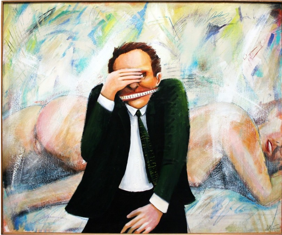
Sol Aquino. Untitled (9/86), 1986

Several of the artists included in the show make multiple appearances throughout the entire city-wide PST landscape of galleries and museums. There are some impressive and surprising works by well-known, even iconic artists; but there are equally intriguing works from names that might be less familiar to current audiences, such as the delightful, cheeky paintings from the 1950's by Fulgencio Corral. Among the many individual highlights, there is work on both institutional and intimate scales, in painting, sculpture, drawing, photography, mixed media and process works, studies and ephemera.