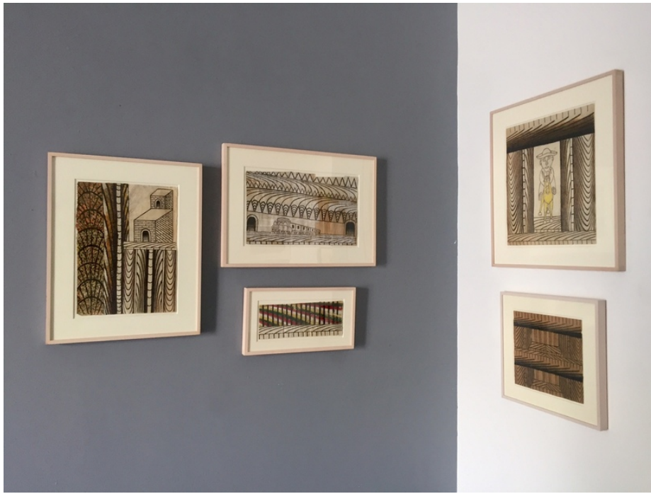
Martin Ramirez, installation view